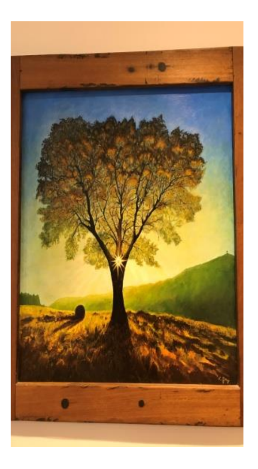
At 7.30pm in St Buryan Chapel Penzance Road, St Buryan, TR19 6DZ

Looking at 'The tree of life' painted by Helen Gray in NZ